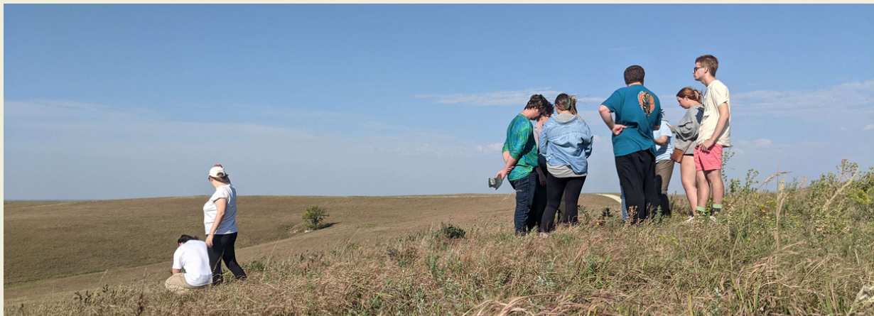
Friends University Students exploring Tallgrass Prairie Preserve.

See our website for the next free and open to the public committee meeting date and full commitment list: grasslandgroupies.org/bee-city-wichita